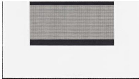
Eisenman Grid Drawing (2009). Copyright Frank Badur.

injecting meaning into a work that is otherwise potentially neutral in its formal exegesis. The visual relationship between the drawing's linear grids and blocks of pale, muted color, and the monument's tiled pathways and concrete stelae is clear and straightforward. Drawing here acts as mental note: a topographic memory and, as the title of the piece states, a reflection.