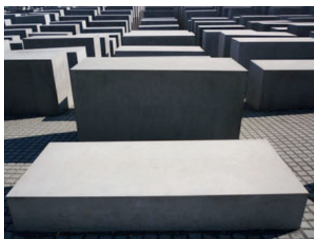
Holocaust Memorial (2005).

The centerpiece of the fruehsorge exhibition is a cycle of drawings called “Reflections on the Eisenman Grid” from earlier this year. It consists of 24 small-scale drawings, presented in close proximity to each other on one wall, in four rows of six. The reference is to Peter Eisenman’s “Monument