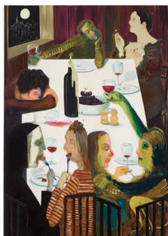
Frank Badur, Why Pattern? (2009).